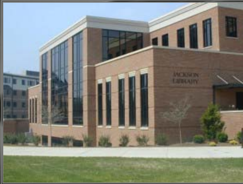
Jackson Library, opened January 2003